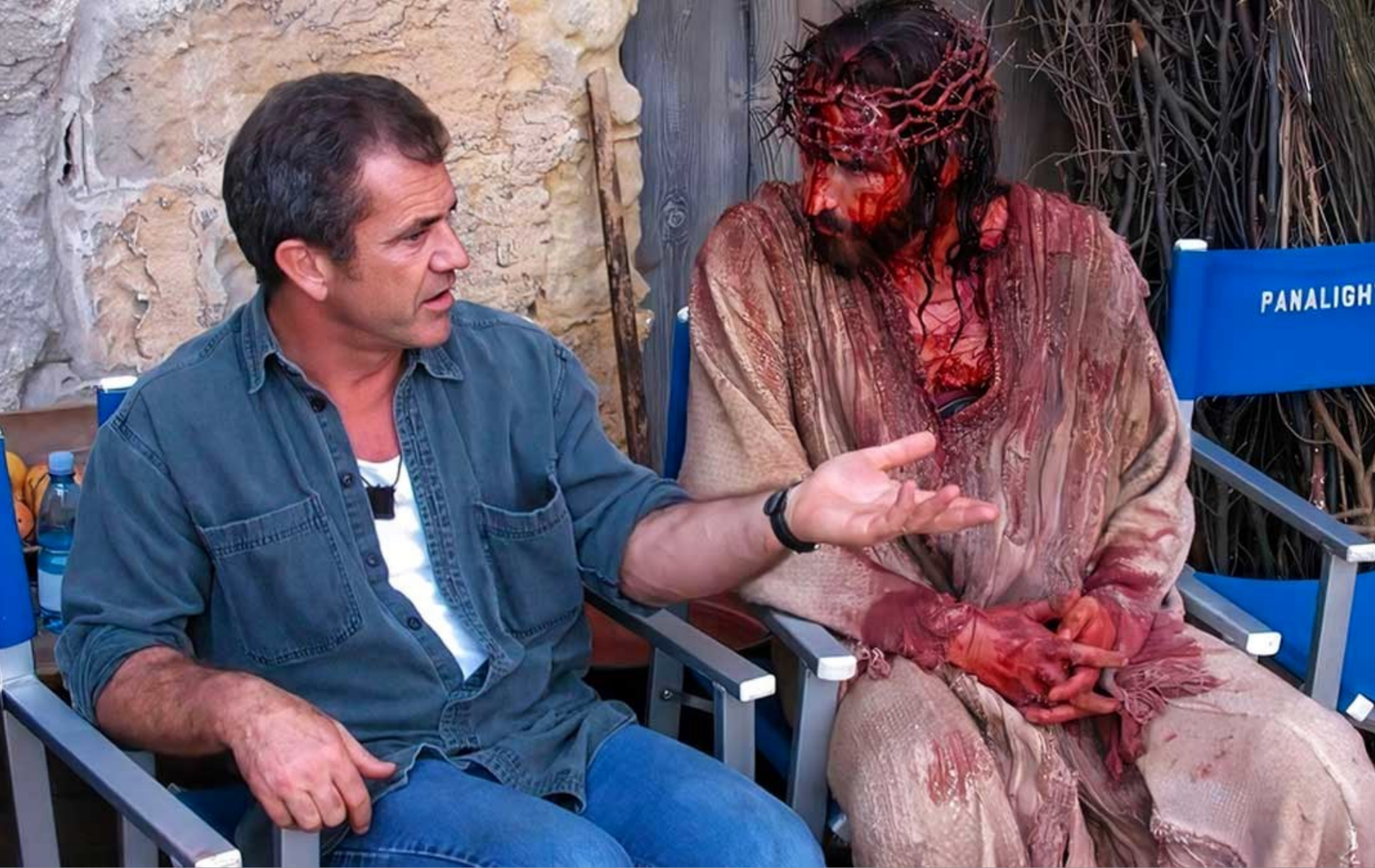
Production photo from The Passion of the Christ (Mel Gibson 2004)